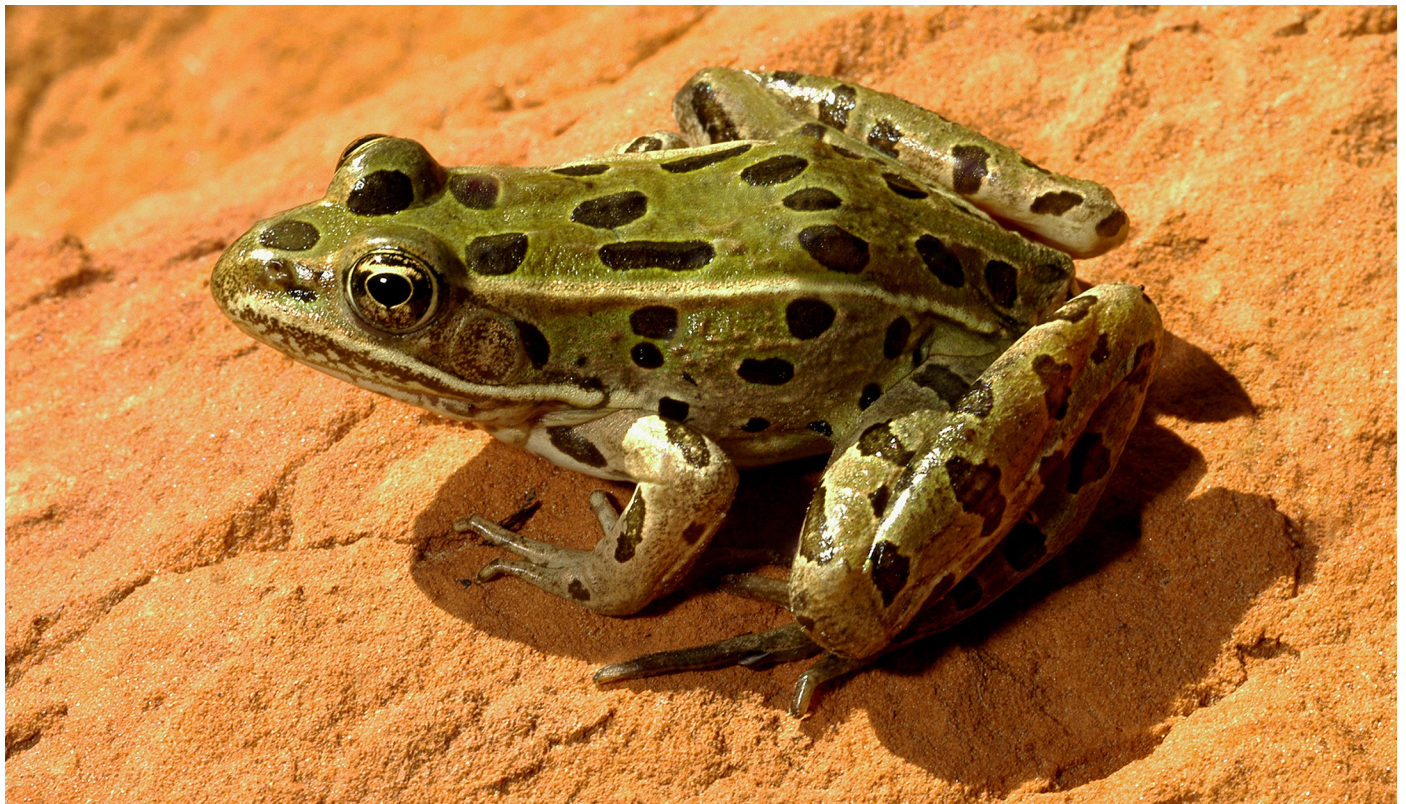
Fig. 1. Northern Leopard Frog ( Lithobates pipiens ).

formally Rana pipiens ; Screver 1782) was once widespread, but has now vanished or declined in much of its western range (Kendell 2000). As a result it has been listed under Schedule 1 of the Species at Risk Act (SARA) and by the Committee on the Status of Endangered Wildlife in Canada as being of “special concern” (Environment Canada 2013). One of the main issues in developing a management plan for the species has been the lack of data on abundance measures and little