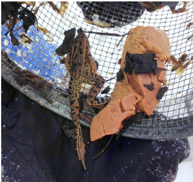
Fig. 3. Northern Leopard Frog ( Lithobates pipiens ) caught in a crayfish trap on 9 December 2013 at the Culvert site on the Qu'Appelle River.

Fig. 3). No signs of feeding were observed; however, frogs were moving around the traps and swam away without lethargy when released. The under-ice water temperature reached a minimum of 0 °C at all trap locations except Site 6. Site 6 (The Queen Elizabeth Power Station) is downstream of a coal and natural gas power station and had a slightly higher temperature of around 2 °C during trapping. The lowest dissolved oxygen content recorded during the trapping period was taken on the Qu'Appelle River near Site 2, where a minimum of 3.9 mg/L was recorded (Table 2). Site 4 was the only Qu'Appelle River site where frogs were not captured. This trapping location was the deepest of the four Qu'Appelle River sites at 4.2 m in depth, and was the only site with a mud only substrate.